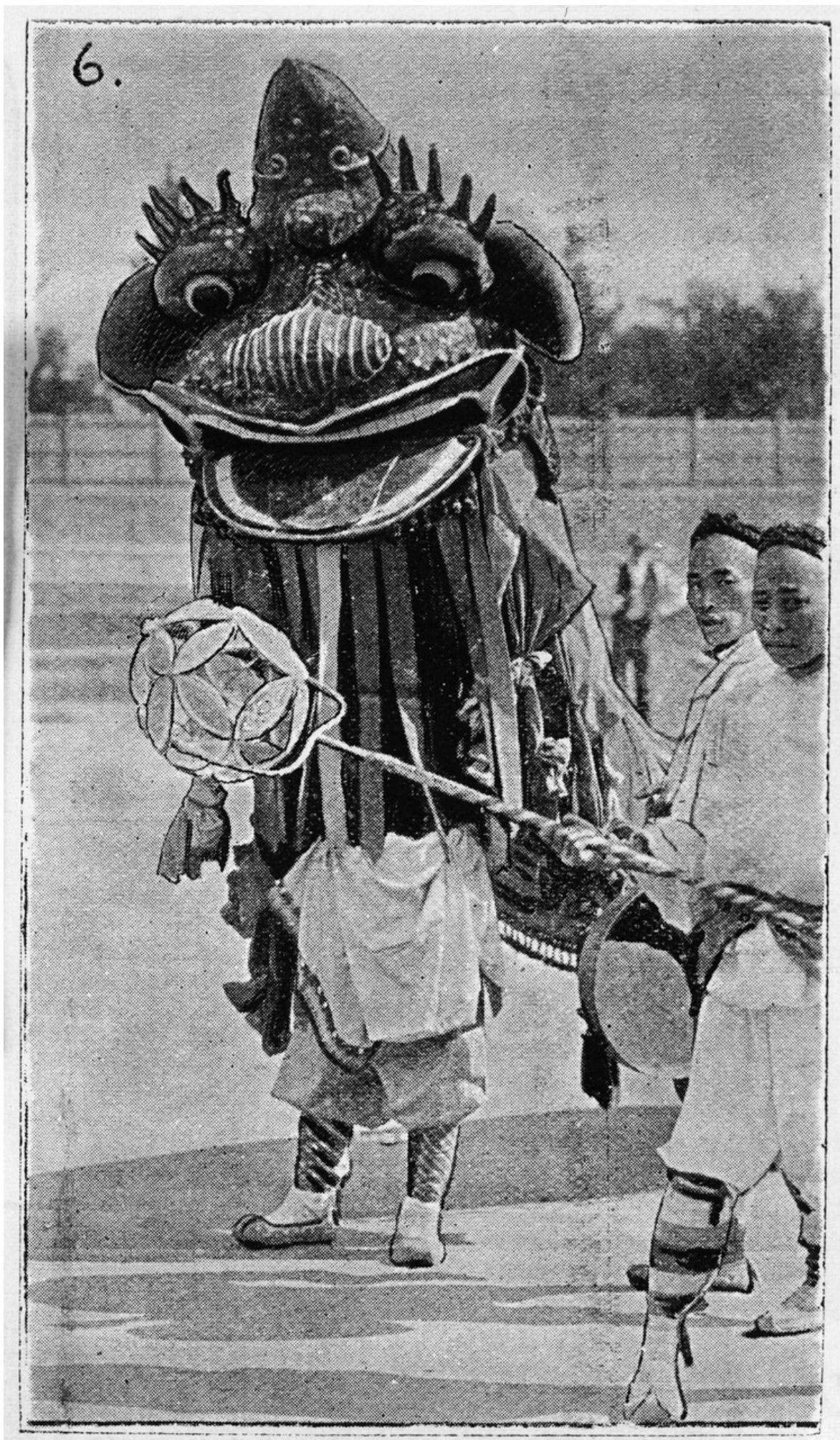
'Bendigo Easter Fair', 1 May 1895, State Library Victoria. Courtesy of State Library Victoria.