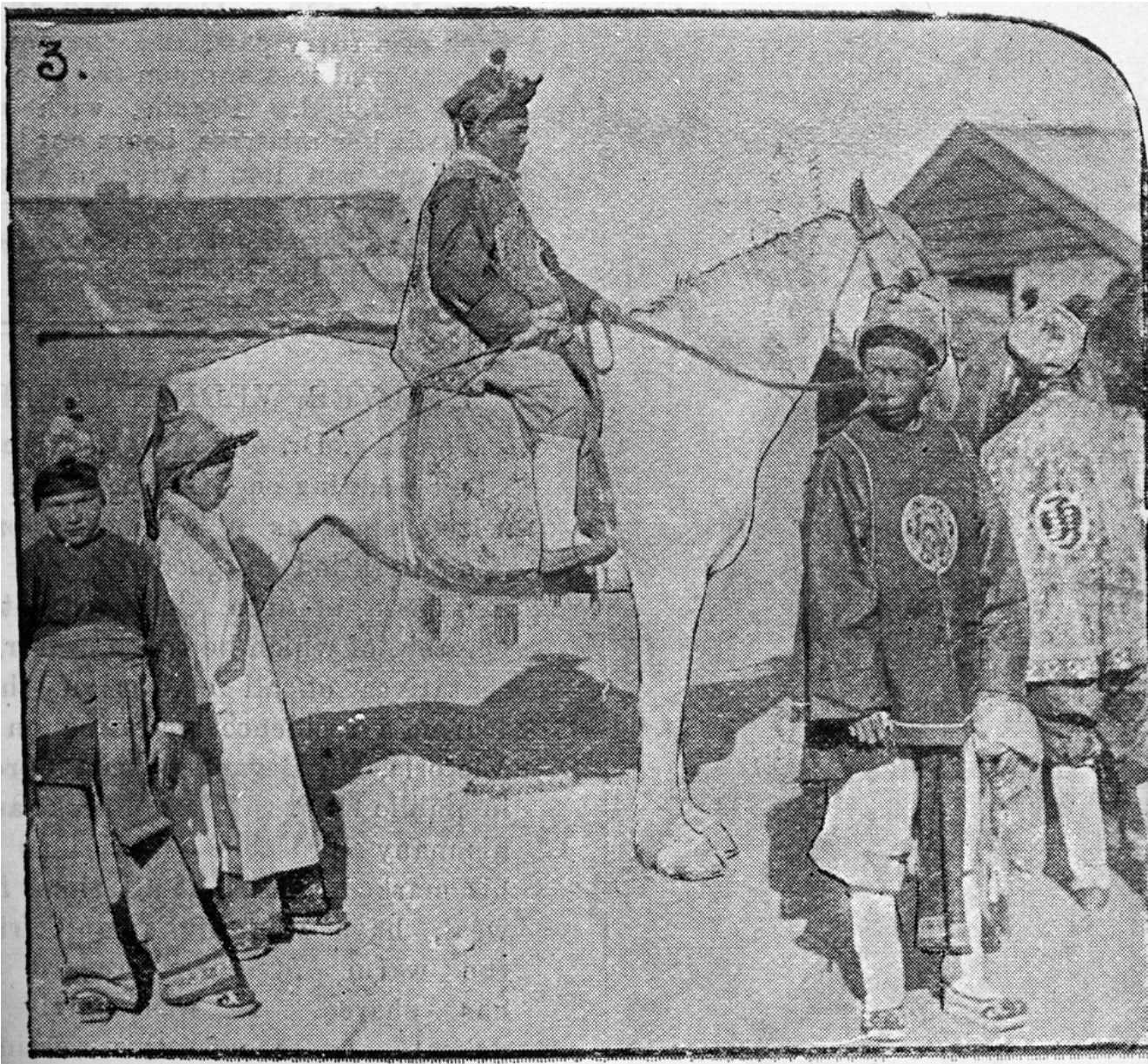
'Bendigo Easter Fair', 1 May 1895, State Library Victoria. Courtesy of State Library Victoria.